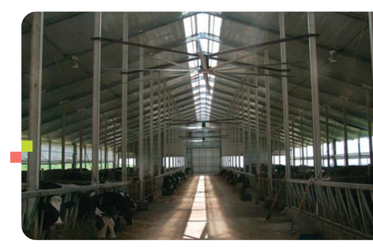
A well-placed HVLS fan is approximately 16 feet off the floor in an area that isn't obstructed by a post, preferably a freestall barn or holding area. Fans should be placed approximately 60 feet apart.

HVLS fans cost approximately $4,200–$5,000 each, including installation. While this is a large upfront investment, keep in mind that you'll need six to seven high-speed fans at $200-$300 each to move the same volume of air. Energy savings over a high-speed fan system should make up the cost difference within two to three years. Barns with