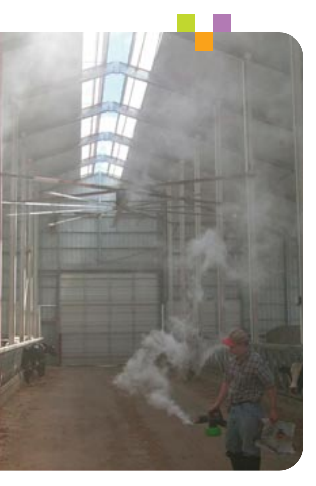
UW researchers used smoke and soap bubbles to visualize the airflow in barns using HVLS fans.